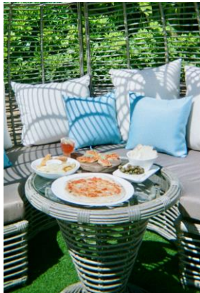
A picture taken during the event

photo shoot for a participant, but I was rejected. I felt so helpless and embarrassed that I hid behind my colleagues and didn't even dare to pick up the camera again. However, after the encouragement of the supervisor, the companionship of my colleagues, and knowing the reason for the rejection, I picked up the camera again. At first, I needed my colleagues to accompany me before I dared to ask the participants if they were willing to be photographed, and finally, I felt comfortable enough to invite the other participants to take photos myself. I learnt from this experience that when I am rejected by others, I should learn to understand their difficulties, and at the same time, I learnt to accept the rejection and adjust my mindset as soon as possible so as not to affect the progress of my work.